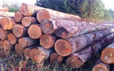
OAK LOGS A grade logs (slicing & peeling)