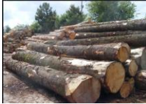
OAK LOGS A B C grade logs (sawing - flooring grade)