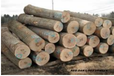
Red Oak Logs Special - C4S 18"+ Veneer - C3S, C4S Sawlog - C2C, C3S