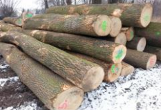
ASH LOGS "The best ash logs"