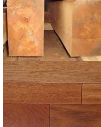
Color – Reddish Brown, brown