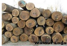
Walnut Logs Special - C4S 18"+ Veneer - C3S, C4S Sawlog - C2S, C3S