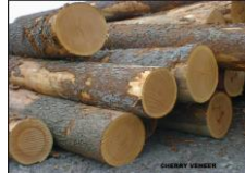
Cherry Logs Special - C4S 18"+ Veneer - C3S, C4S Sawlog - C2S, C3S