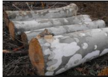
SYCAMORE LOGS "precious and rare logs available at competitive prices"