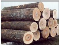
Hard Maple Logs Special - C4S 16"+ Veneer - C3S, C4S Sawlog - C2S, C3S