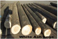
White Ash Logs Special - C4S Veneer - 3CS/C4S Sawlog - C2S, C3S