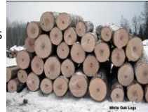
White Oak Logs Special - 4CS 18"+ Veneer - C2S, C3S Sawlog - C2S, C3S